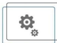
Can upgrade to Android 13