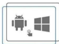
40 Touch Points Android & Windows OS